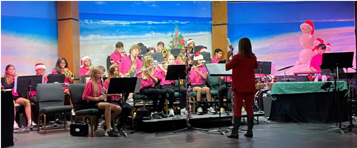
Marco Island Charter Middle School Jazz Band Performing for the December AAUW Meeting