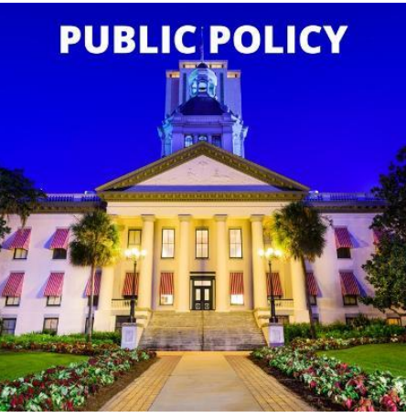
Florida State Capital Building

The Florida AAUW Public Policy Committee met virtually on 10/21. The main focus was Lobby Day which will be held January 18^{th} and 19^{th} 2022. A decision will be made soon as to whether this will be an in-person experience or online or a combination of the two. The specific bills that will be advocated have not yet been determined.